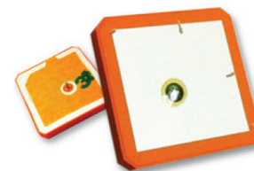
Image does not reflect the actual size of the antenna