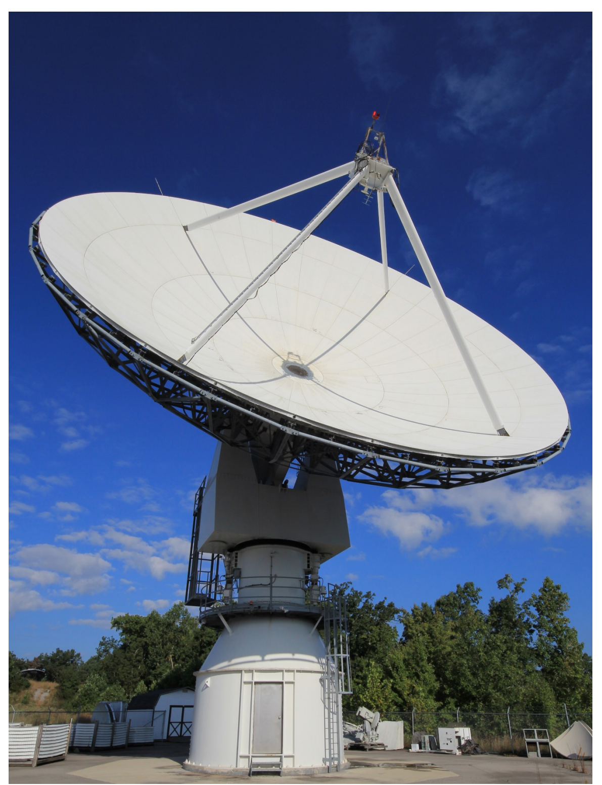
Photograph of the Morehead State University Space Science Center 21 Meter Space Tracking Antenna September, 2019