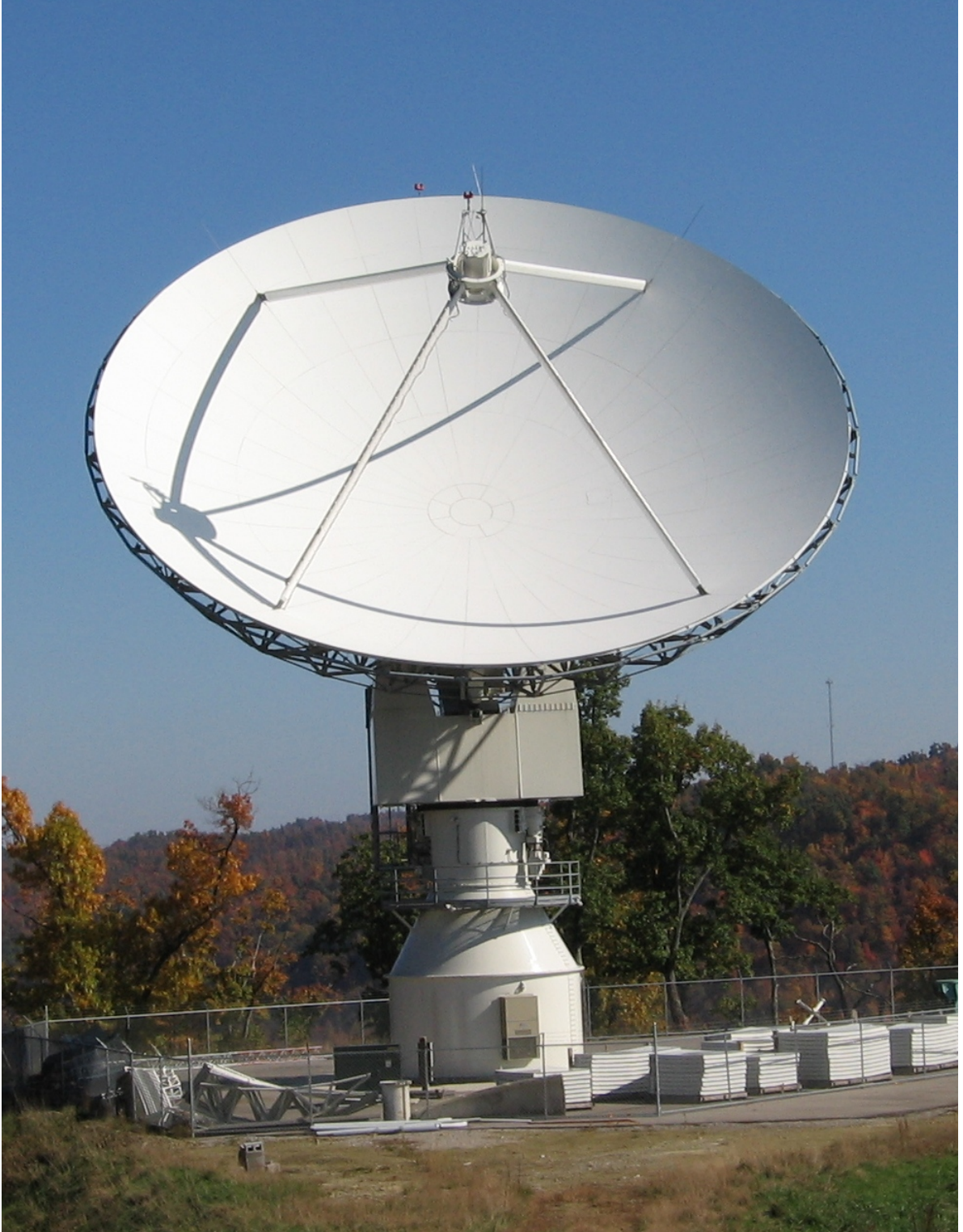
Photograph of the Morehead State University Space Science Center 21 Meter Space Tracking Antenna September, 2007