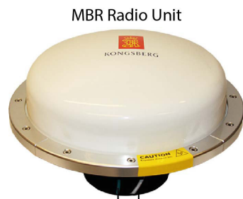
MBR Radio Unit