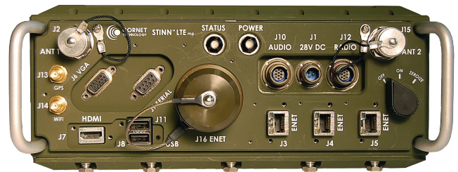
STINN LTemp Front View