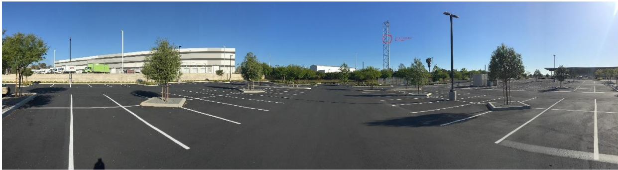
Figure 1. Panoramic view from East to South to West of area near Antenna Tower.

The figures below show the antenna tower located at Lat/Lon previously noted where a radio antenna horn will be mounted to the tower.