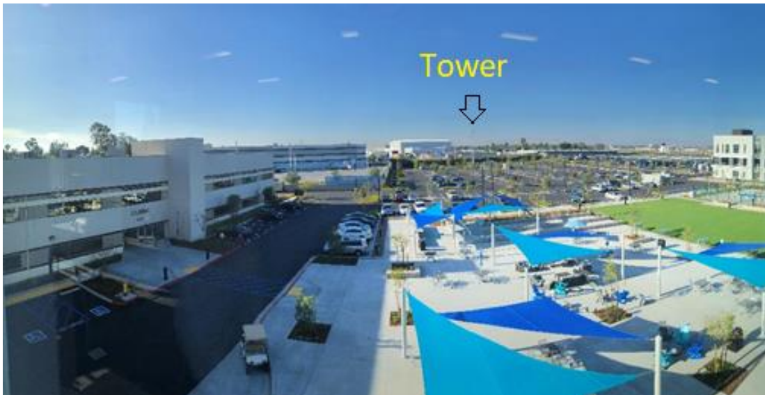
Figure 2. Panoramic view from East to South to West of company campus.