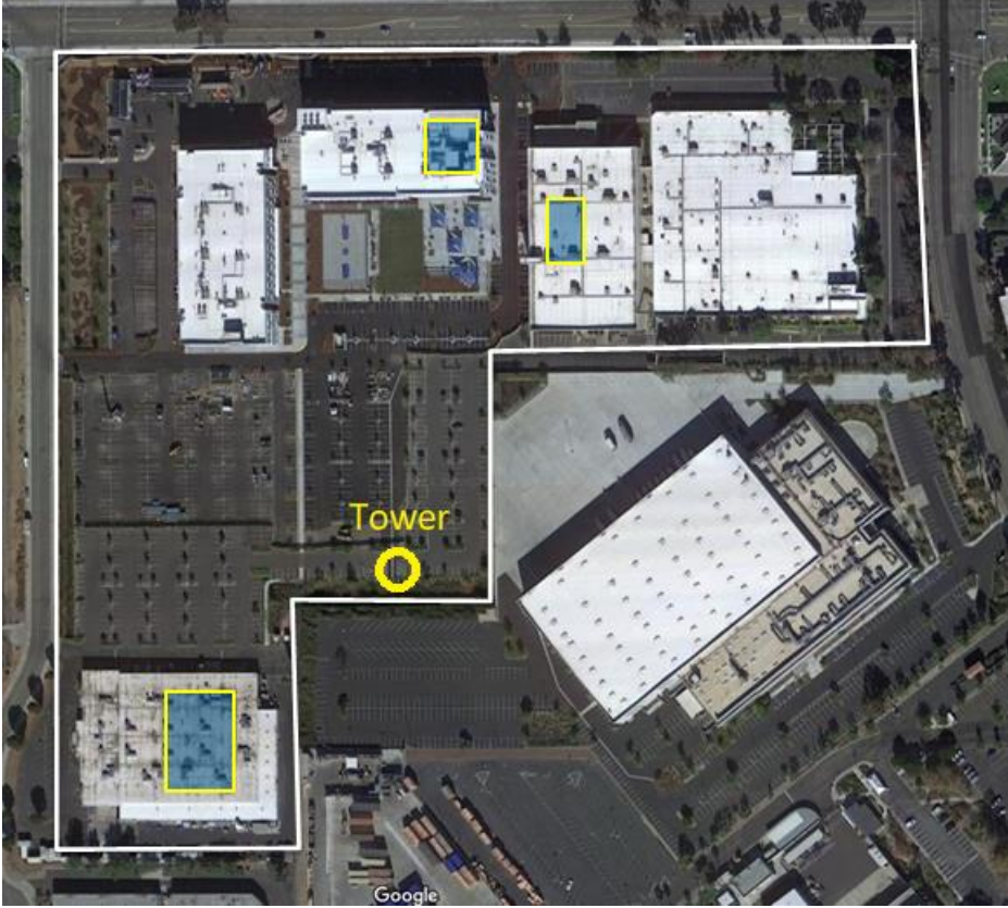
Figure 3. Google Earth View of Company Campus and Tower Location

There are five (5) buildings on the Cubic company campus as seen inside the white line border below. All antennas will be installed on building rooftops except for one on the tower, whose location is denoted by the yellow circle.