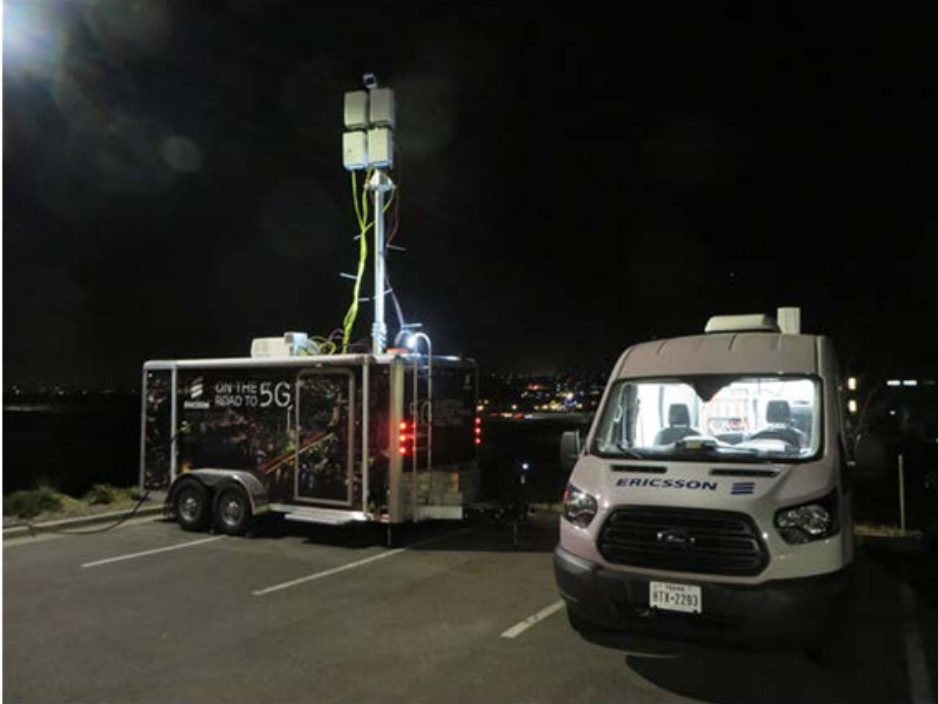
Mast and components will not extend beyond 10.7 meters above ground.