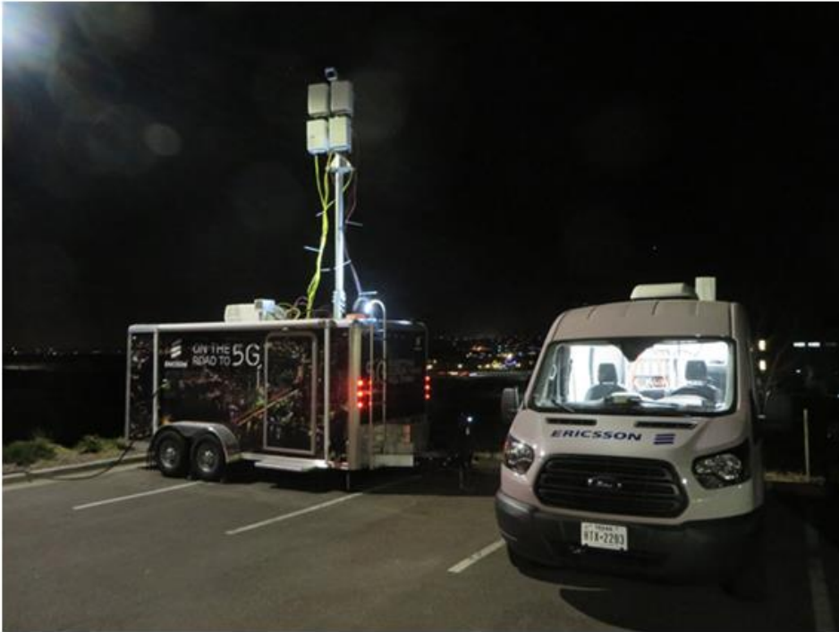
Mast and components will not extend beyond 10.7 meters above ground.