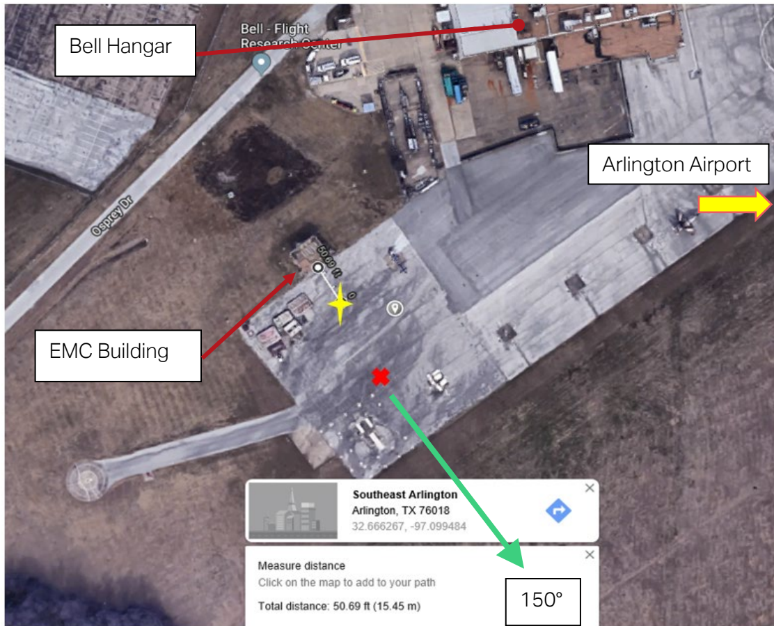
Figure 1: Aerial View of Test Location

Testing will be conducted onsite at the Bell Flight Test Research Center located at 600 Interstate 20 east, Arlington, TX 76018. The specific location in WGS 84 coordinates is Latitude 32° 39' 58.56" N and Longitude 97° 5' 58.14" W at an elevation of 191 m. Figure 1 below shows an aerial view of the test location. The antenna location, indicated by the yellow star, will be approximately 50 feet in front of the EMC building. The aircraft location (red X) will be 100 feet from the antenna. The tallest antenna is 15m tall in the vertical position. The height of the EMC building is about 5 meters tall. The facility building is about 15 meters tall and 80 meters wide providing some blockage to the north.