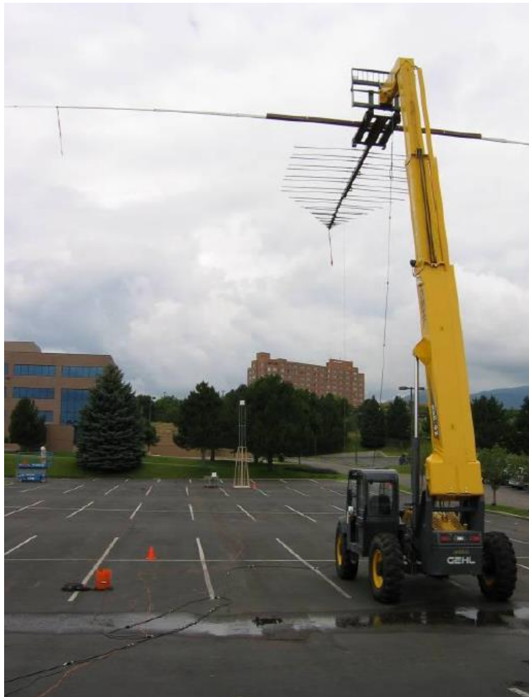
Figure 3 Proposed CWI Antenna System Mounting Scheme (Telehandler Height Maximum 55ft.)