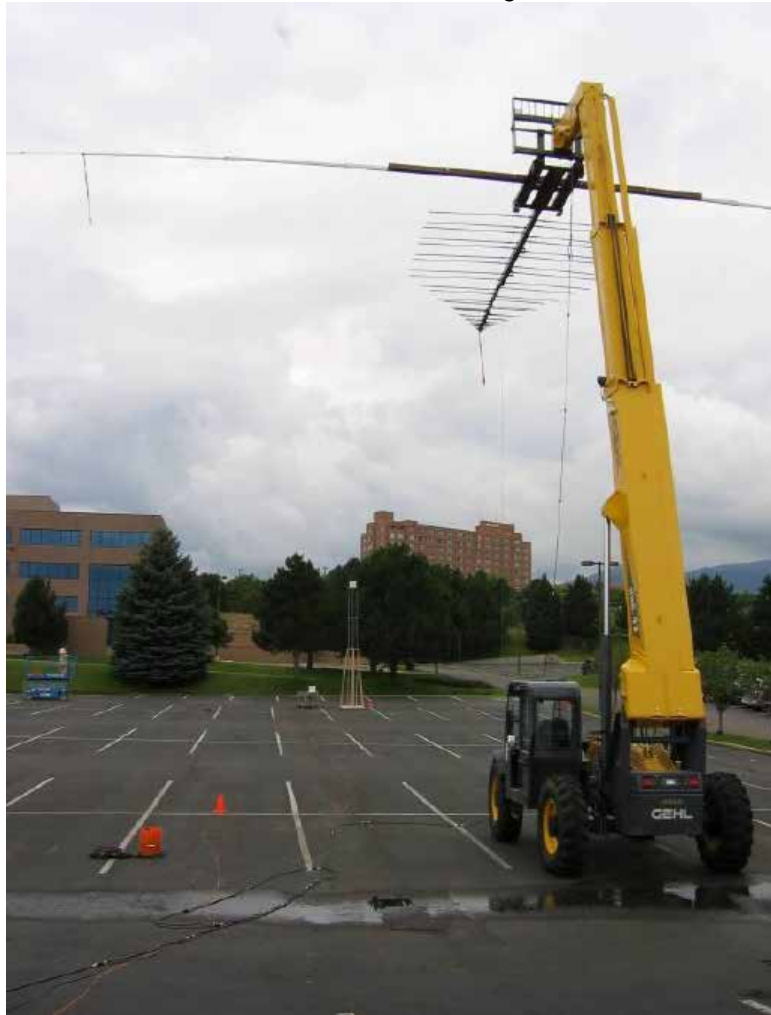
Figure 2 Proposed CWI Antenna System Mounting Scheme (Telehandler Height Maximum 55ft.)