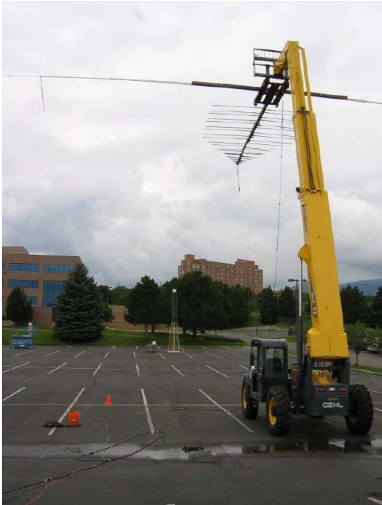
Figure 2 Proposed CWI Antenna System Mounting Scheme (Telehandler Height Maximum 55ft.)