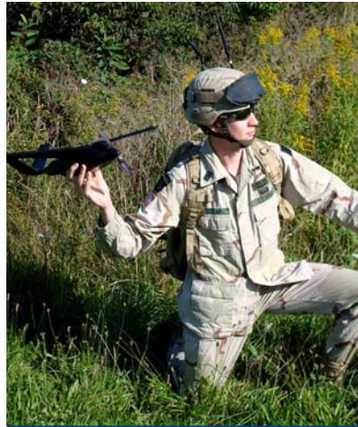
Man-packable and deploys fast

The TOWlaunch system can be mounted on a building or placed in the TOW launcher of a combat vehicle, allowing for its use without exposing any personnel to harm.