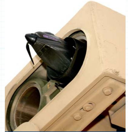
TOWLaunch delivers automatic "fly to cue"