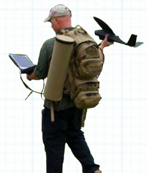
Quickly from tube storage to flight

60 +/- minutes of runtime 10+ kilometer range 25-40 mph cruising speed 11,000 foot operating ceiling Built-in failsafe modes Lithium polymer battery Electro-optical camera and thermal imager