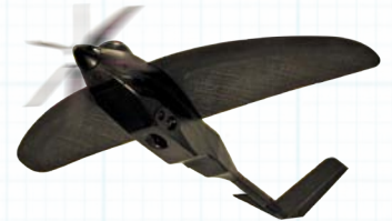
10+ km range

The mobile and affordable option for aerial reconnaissance, the Nighthawk is a force multiplier that is well suited to solve a variety of battlefield and fixed site security challenges. Able to integrate with existing security systems and with added capabilities like automatic tube launching from vehicles or fixed installations, Nighthawk offers a more complete security solution than typical small airborne systems with unequaled ease of use.