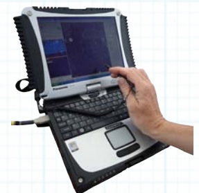
Autopilot or assisted flight modes

Hundreds of TACMAV (2nd generation Nighthawk) systems deployed in combat.