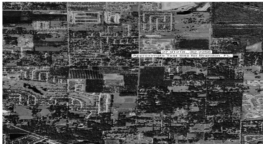
FIGURE 8 – ECM Test Site in Brandon, Florida

The final ECM will be located near the Sears Auto and Tire Center at 686 Brandon Town Center Mall in Brandon, Florida. Figure 8 is an aerial photo of the proposed site.