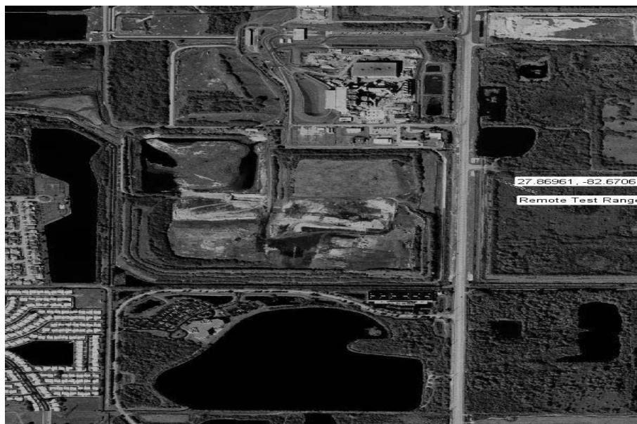
FIGURE 6 – Remote Test Range in St. Petersburg, Florida

The second ECM will be placed at ATK Remote Test Range, which is located at 10901 28 th Street North, St. Petersburg, Florida. This location is approximately 1.25 miles from the ATK Clearwater facility. Figure 6 shows the location of the Remote Test Range. When this aerial photo was taken, the ATK Remote Test Range had not been built.