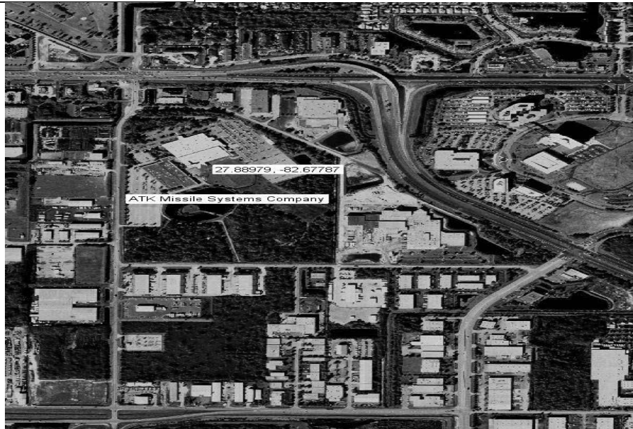
FIGURE 5 – ATK Missile Systems Company in Clearwater, FL.