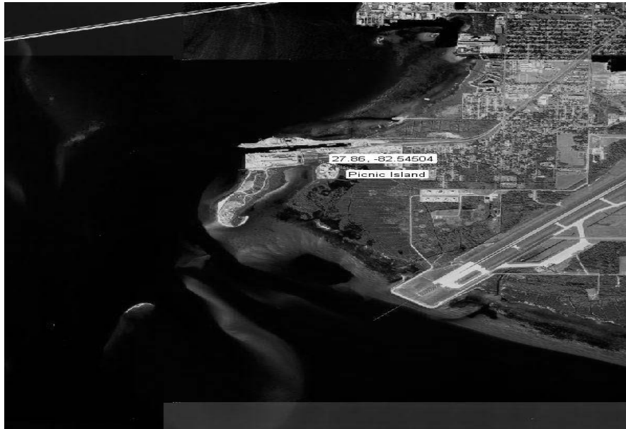
FIGURE 7 – Picnic Island in Tampa, Florida

The third ECM will be located at 7404 Picnic Island Boulevard, Tampa Florida during the U.S. Test of MGARJS. The unit will be transported to Picnic Island only to test the communications link to the Command Post at the ATK Clearwater Facility. Figure 7 is an aerial photo of Picnic Island.