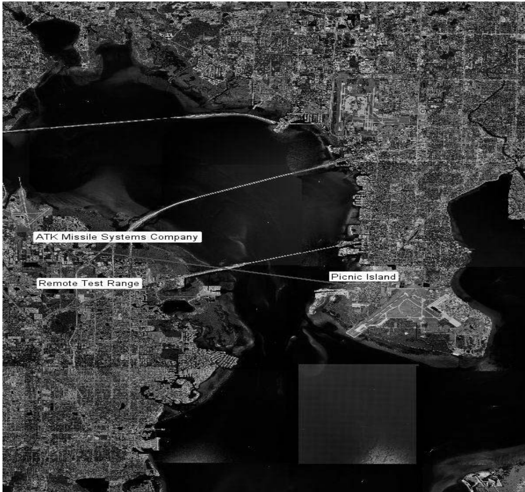
FIGURE 4 – U.S. Test Site Locations for MGARJS

Figure 4 shows the two counties, Pinellas and Hillsborough, where MGARJS will be tested in Florida.