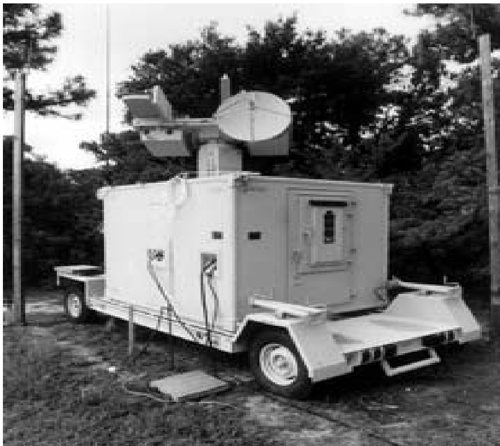
FIGURE 2 – ECM Station Exterior

The ECM is the unit that provides the jamming capability. The Electronic Countermeasures station (ECM) has over 19 different programmable noise and deception techniques. The ECM will output 250 kilowatts of effected radiated power towards the identified threat. The frequency range is from 8 GHz to 18 GHz. The ECM's will be at least 100 meters away from any other station, with one ECM being located 25 miles away from the command post. Figure 2 is a picture of the ECM exterior.