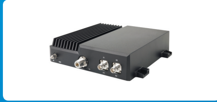
High Power Amplifier, Low Noise Amplifier and Diplexer (HLD)