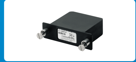
Configuration Module (CM)