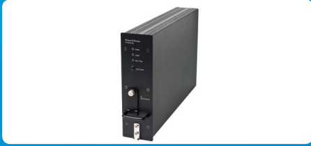
SwiftBroadband Unit (SBU)