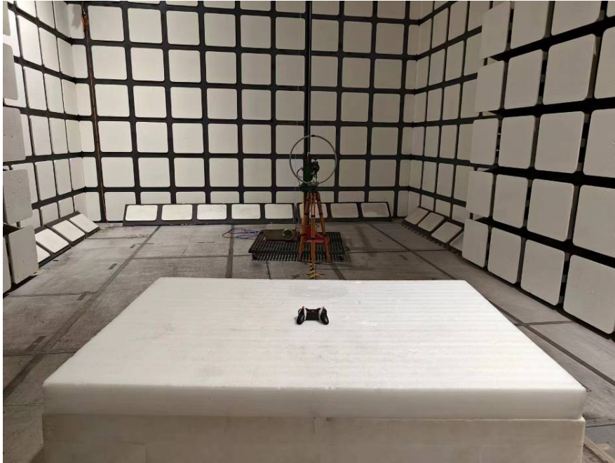
Radiated Emissions View (30-1000 MHz)