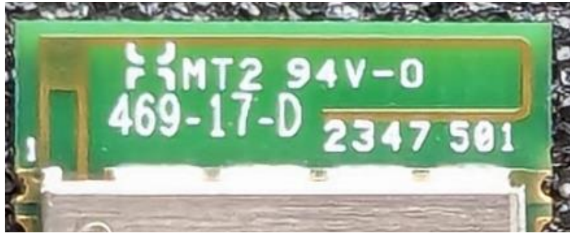
Figure 1: Printed Antenna on DA14592MOD