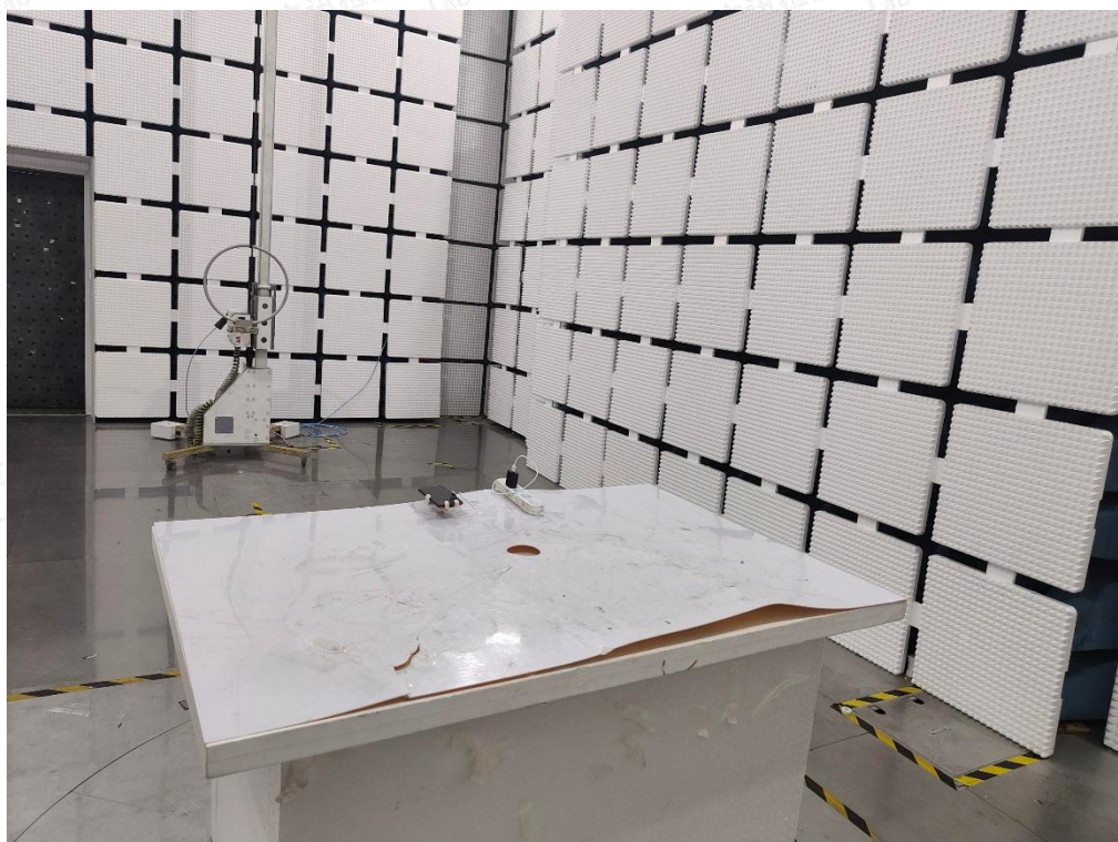
Radiated Emission below 30MHz-AC adapter charge mode